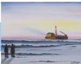
Cover image courtesy of Frank Bercha, The Molikpaq , original oil on canvas painting